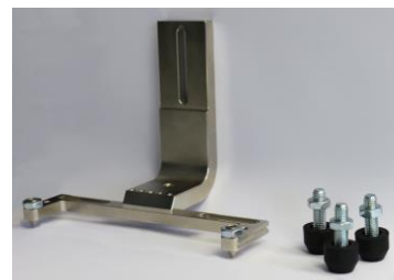
Workpiece support for flat workpieces