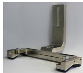
Prism holder for round workpieces are optional