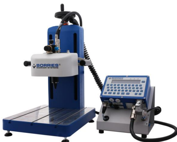
313 optional with table and column